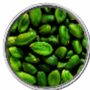
Pistachio Nuts, Shelled